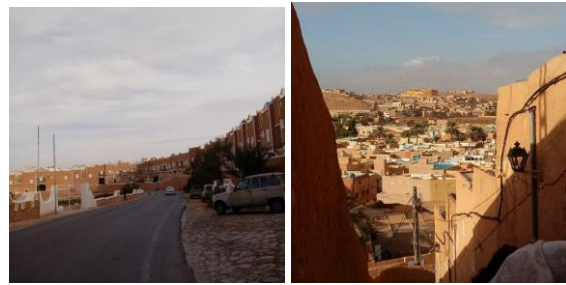
Figure 3: General view at Tafilelt at left and Beni Isguen at right (Author, 2017).

However, the constitution of the ksar of Tafilelt demonstrates that this new urban model aspires not only the protection, the enhancement and the sharing of the ksourien heritage; it also revisits these cultural values for an adaptation to a more modern life framework.